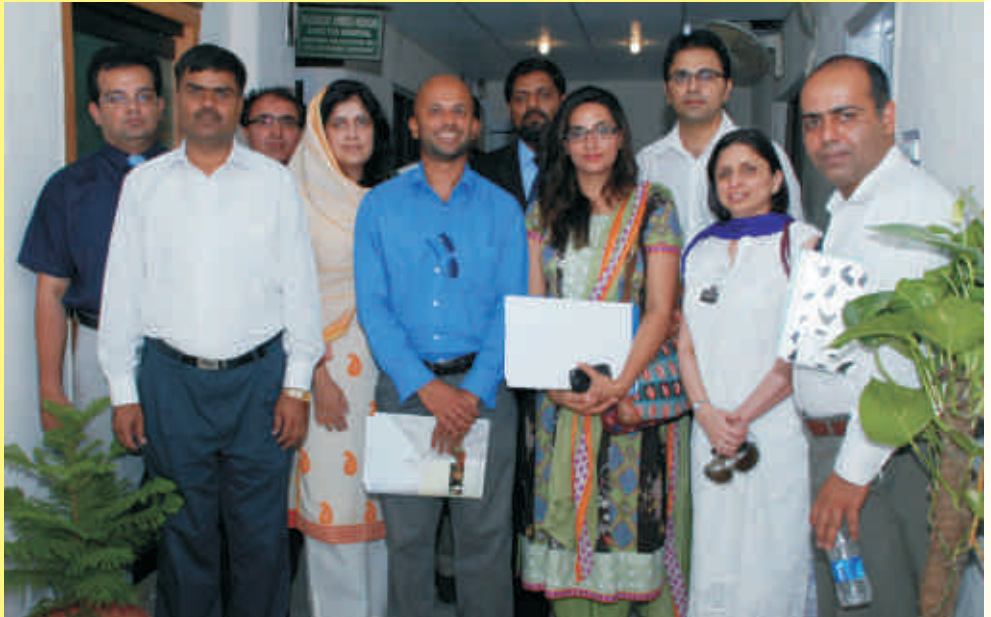
DFID, UNDP, DTCE representative during the visit to a project in Tando Alla Yar, Sindh.

projects, the mission also held meetings with the officials concerned of provincial governments of Sindh and Punjab, local communities and other stakeholders. As an outcome of the review, the mission appreciated