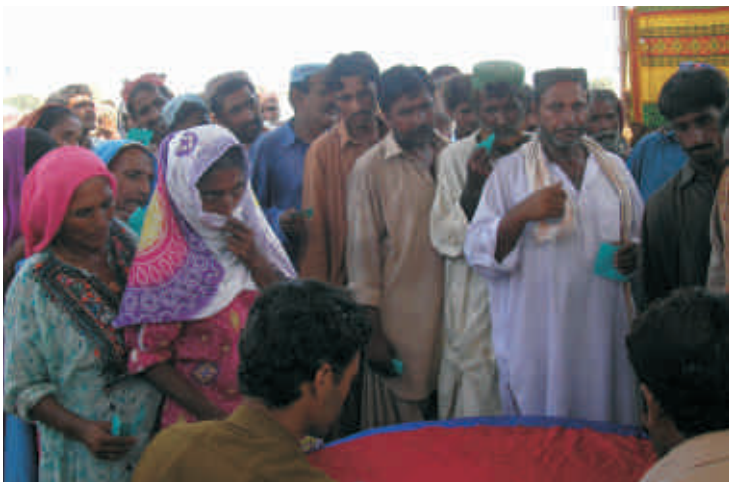
Flood victims getting themselves registered with DTCE staff in Balochistan.

The LCAs/DTCE flood relief activities concerning food distribution ended by mid October.