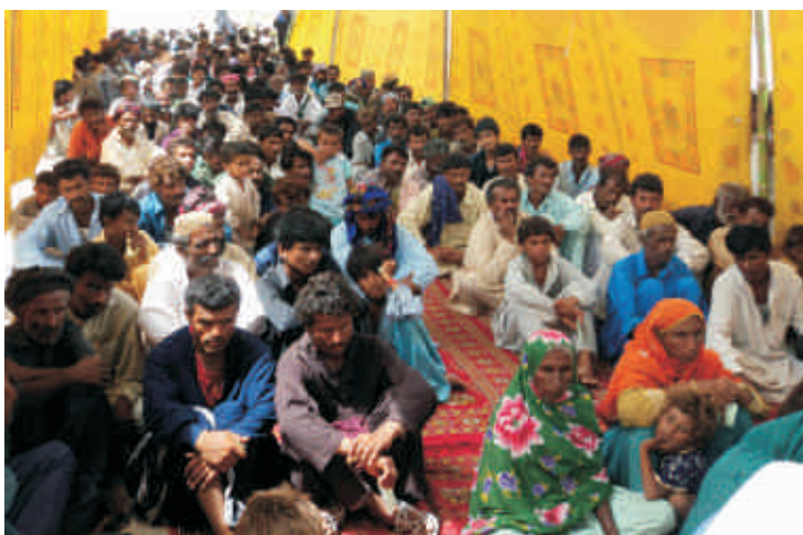
Flood victims await their turn inside Dhamdamo camp in Thatta.

The also pledged to help the flood victims till their return to their homes. They called upon the people not to give in hope and fight against the disaster with courage.