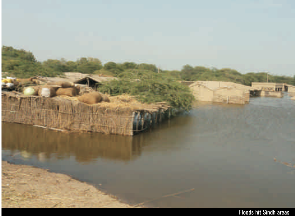
Floods hit Sindh areas

Associations (LCAs), Citizen Community Board Networks (CCBNs), Civil Society Organizations (CSOs), Village and Neighbourhood Councils (V&NCs) district Press Clubs, district Bar associations and former local government leaders. Keeping in view the salient features of the program the JPJM had evolved a transparent mechanism of monitoring of goods' distribution and funds utilization through setting up committees. These committees finalized after thorough scrutiny the lists of most