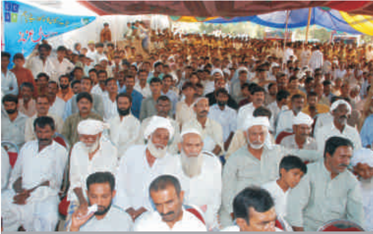
Flood victims sit in a tent at Budh UC in Muzaffargarh.