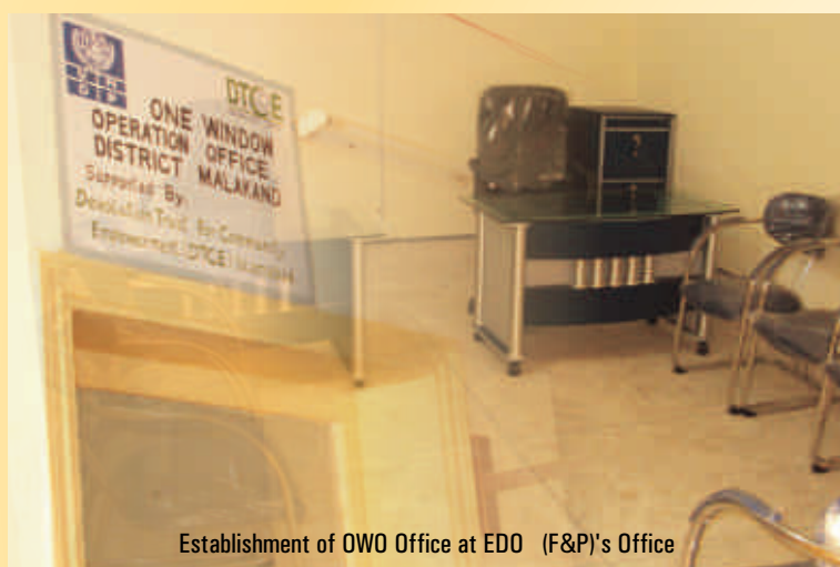
Establishment of OWO Office at EDO (F&P)'s Office

The District Press Club will participate in Community Empowerment Round Table (CERT) and will arrange press forums at district level. It will also facilitate press coverage of the activities undertaken by DTCE in the district. The Press club Malakand formed a committee consisting of 5 members including (Chairman and Gen Secretary) who will facilitate press coverage of DTCE activities.